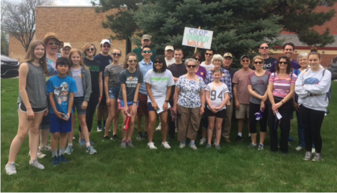
CROP Walk 2018